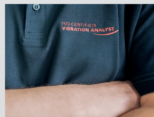
Service & Support

Laser measurement systems and services for optimum alignment of machines and systems.